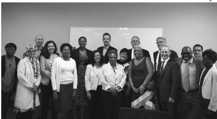
A July 2019 meeting of Mayor Lori Lightfoot and United Power representatives, including parishioner Renee Reilly (left of Mayor Lightfoot).