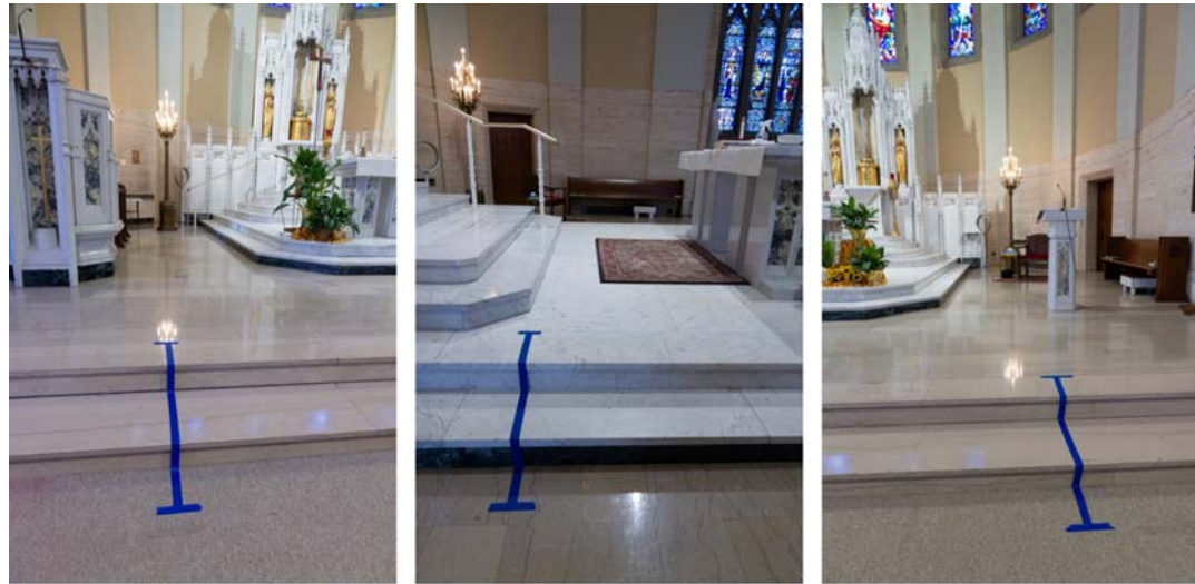
Location of the three proposed handrails on the altar.