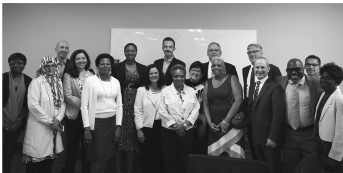
A July 2019 meeting of Mayor Lori Lightfoot and United Power representatives, including parishioner Renee Reilly (left of Mayor Lightfoot).