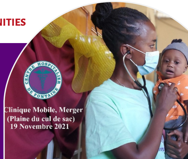
Clinique Mobile, Merger (Plaine du cul de sac) 19 Novembre 2021