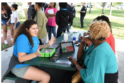
RSVP: FAFSA W/TH/F