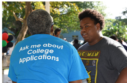
RSVP: FAFSA SATURDAYS