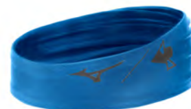
5X5X Brilliant Blue