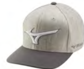
9595 Heathered Grey