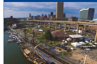
Visit to Buffalo's Canalside