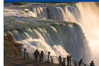
World's most famous Falls