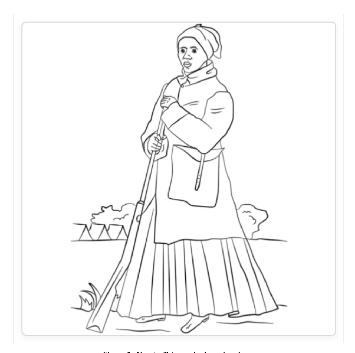
Figure 2: Harriet Tubman, by Lena London

Permission: Free for personal, educational, editorial or noncommercial use. This work is licensed under a Creative Commons Attribution–Noncommercial 4.0 License. Attribution is required in case of distribution.