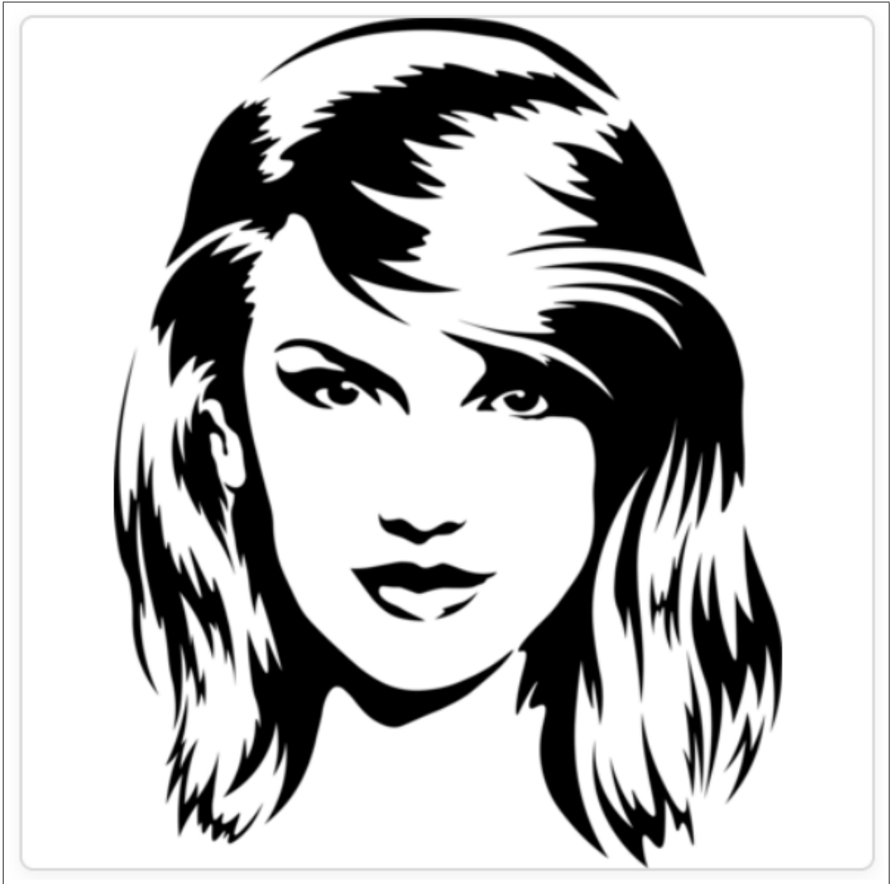
Figure 2: Taylor Swift , by SuperColoring

Permission: Free for personal, educational, editorial or noncommercial use. This work is licensed under a Creative Commons Attribution-Noncommercial 4.0 License. Attribution is required in case of distribution.