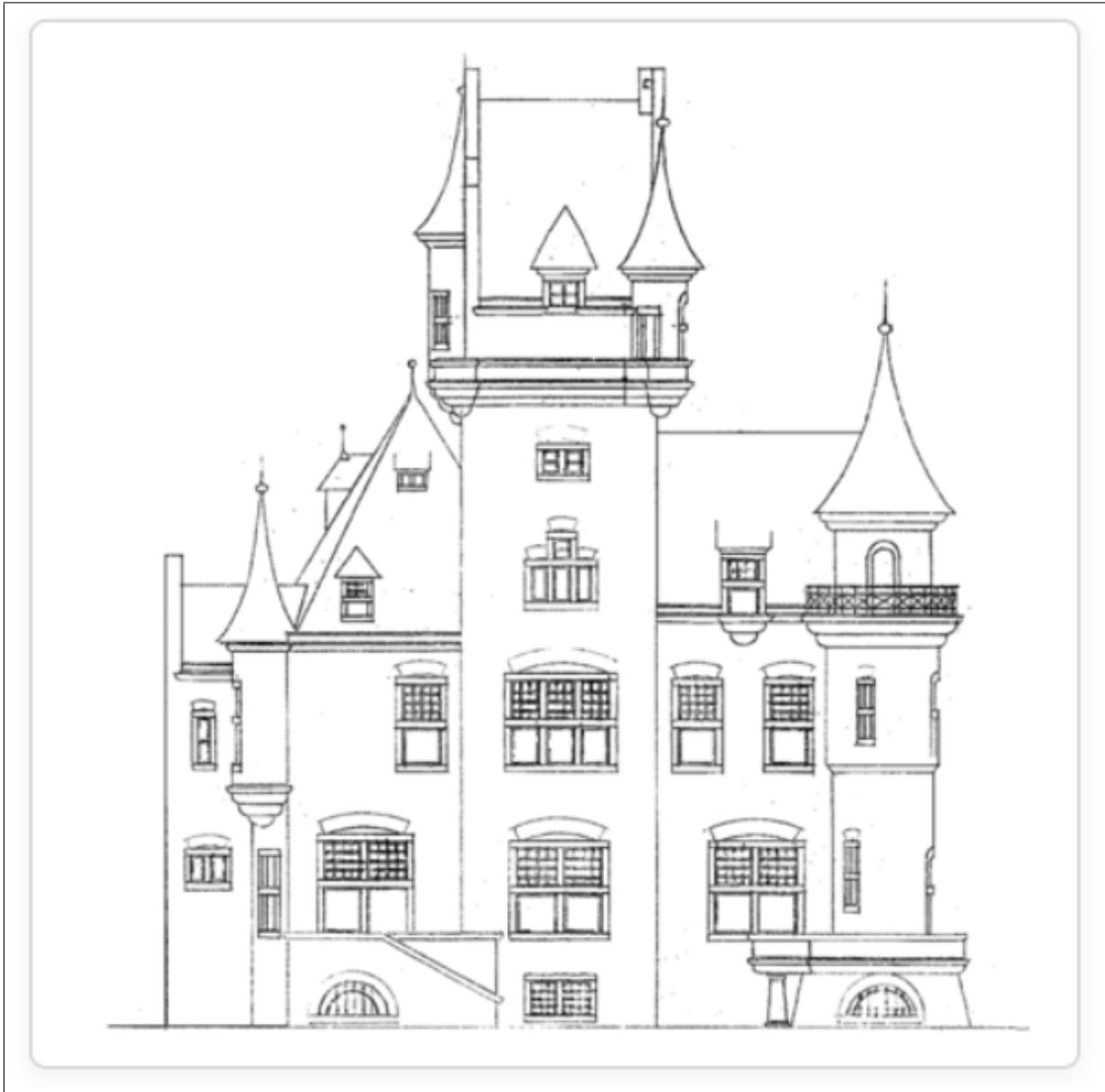
Figure 1: Villa Kocks, Bonn, Germany , original image credit: drawings of Buildings in Bonn on Wikimedia

Permission: Free for personal, educational, editorial or commercial use. This work is in the Public domain. Attribution is not required but welcomed.