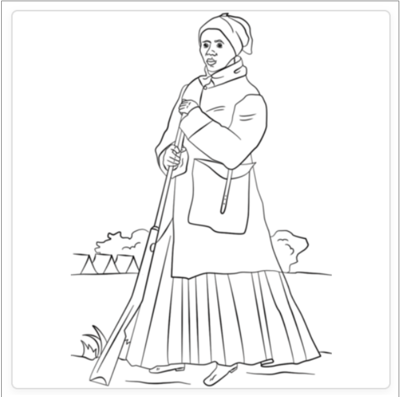
Figure 2: Harriet Tubman , by Lena London

Permission: Free for personal, educational, editorial or noncommercial use. This work is licensed under a Creative Commons Attribution–Noncommercial 4.0 License. Attribution is required in case of distribution.