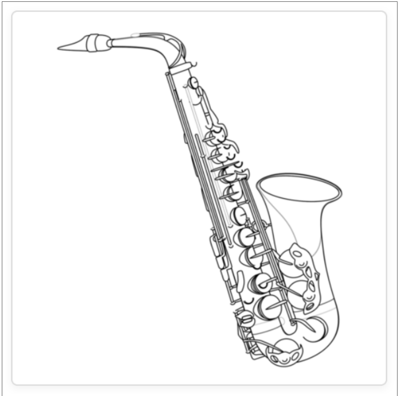
Figure 2: Saxophone

Permission: Free for personal, educational, editorial or commercial use. This work is in the Public domain. Attribution is not required but welcomed.