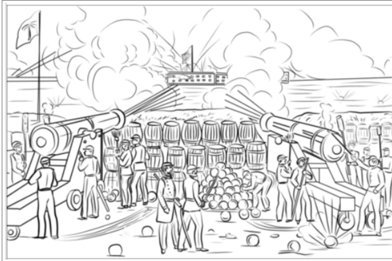
Figure 2: Bombardment of Fort Sumter , by Nata Silina

Permission: Free for personal, educational, editorial or commercial use. This work is licensed under a Creative Commons Attribution-Share Alike 4.0 License. Attribution is required in case of distribution.