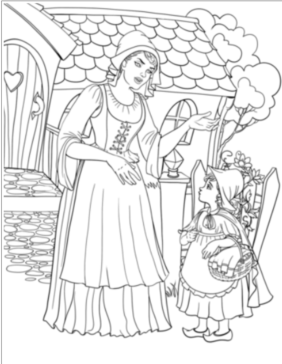
Figure 1: Mother asks Little Red Ridding Hood to Visit her Grandmother , by Lesya Adamchuck

Permission: Free for personal, educational, editorial or noncommercial use. This work is licensed under a Creative Commons Attribution–Noncommercial 4.0 License. Attribution is required in case of distribution.