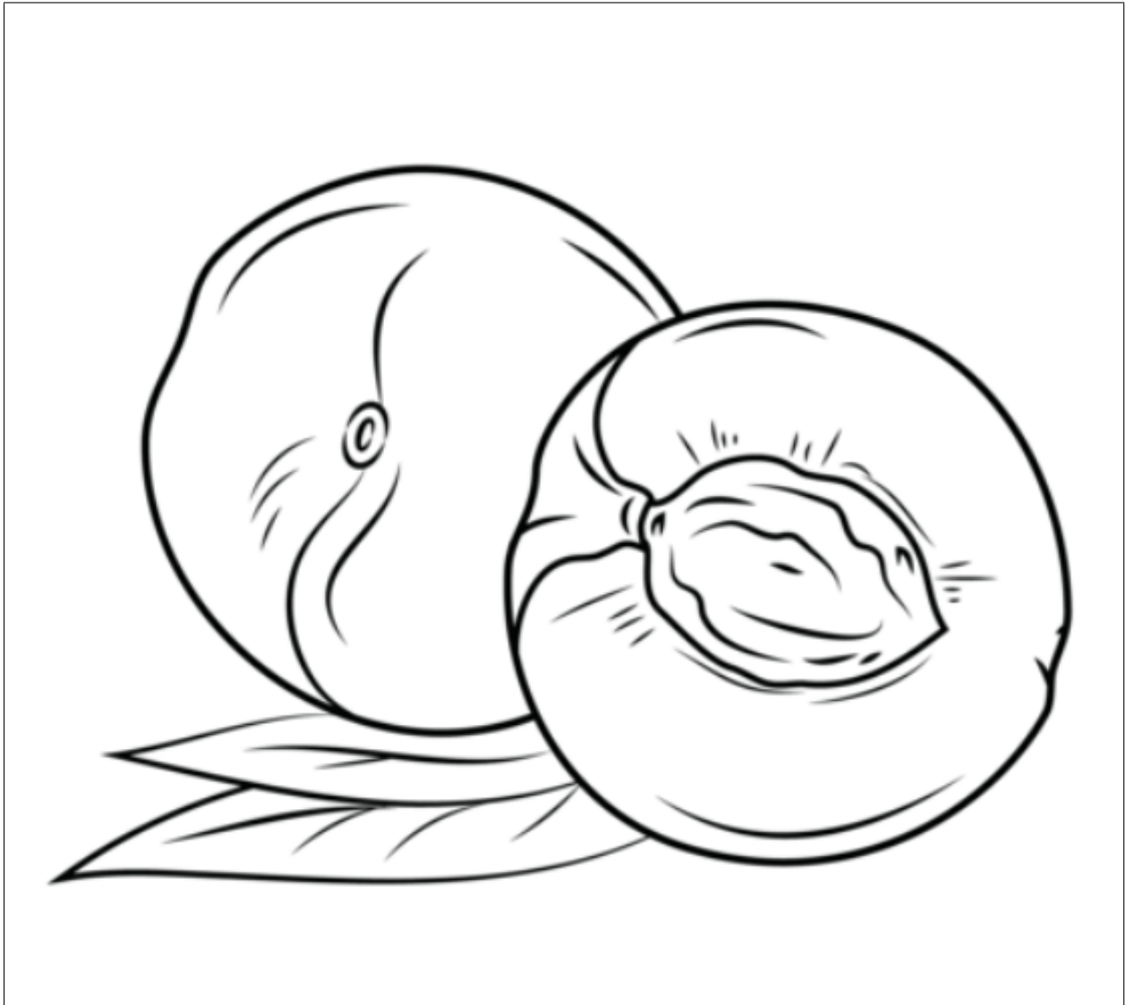
Figure 2: Nectarine , by Artsashina

Permission: Free for personal, educational, editorial or commercial use. This work is licensed under a Creative Commons Attribution-Share Alike 4.0 License. Attribution is required in case of distribution.