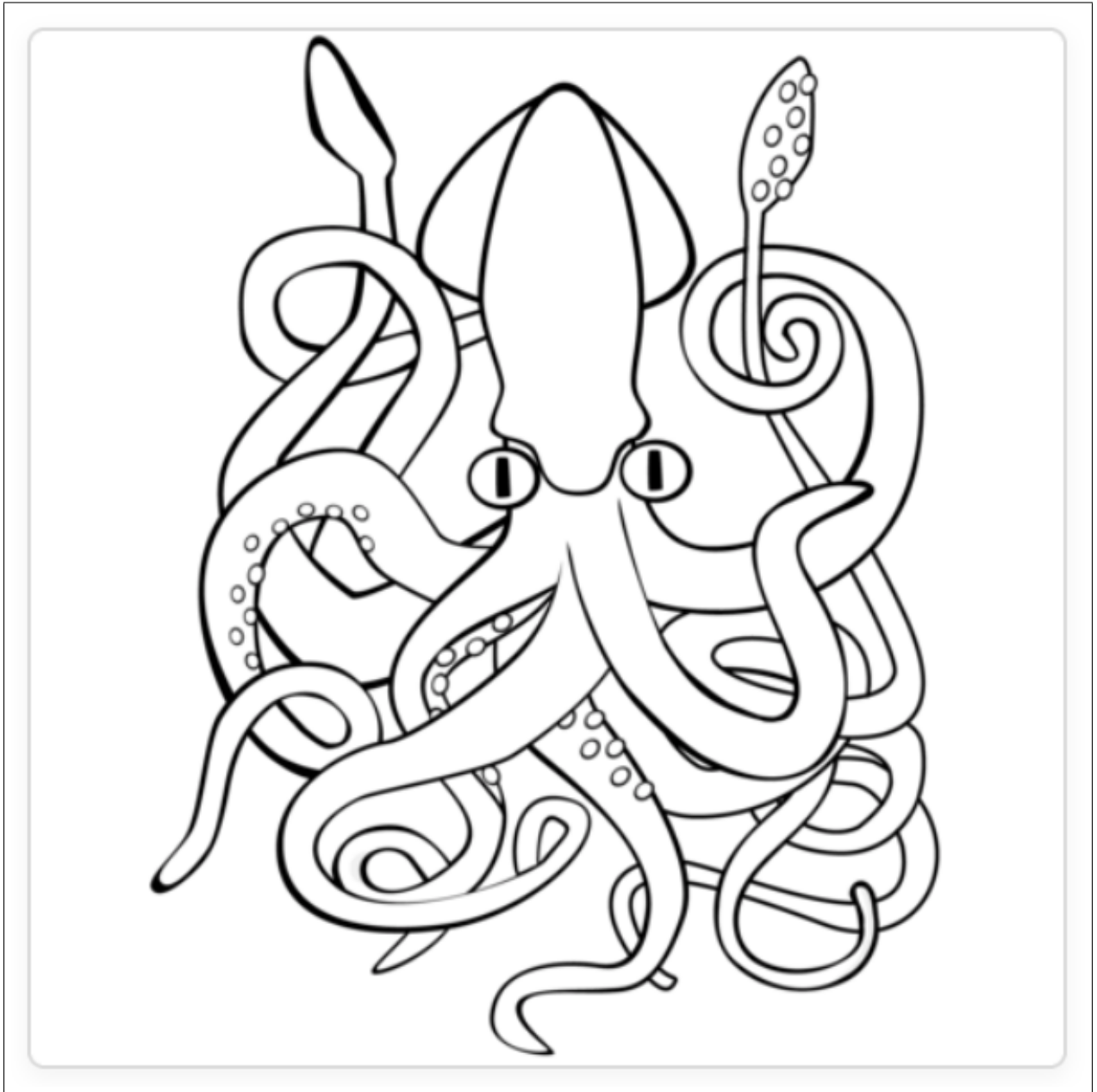
Figure 1: Squid

Permission: Free for personal, educational, editorial or commercial use. This work is in the Public domain. Attribution is not required but welcomed.