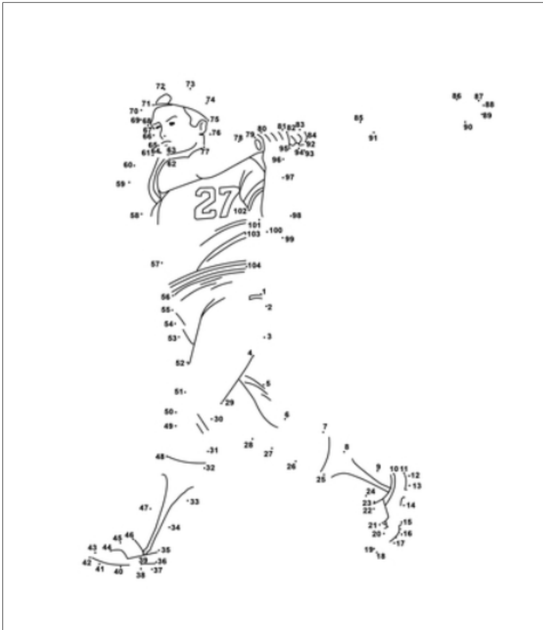
Figure 1: Baseball Player Dot to Dot , by Painter

Permission: Free for personal, educational, editorial or noncommercial use. This work is licensed under a Creative Commons Attribution-Noncommercial 4.0 License. Attribution is required in case of distribution.