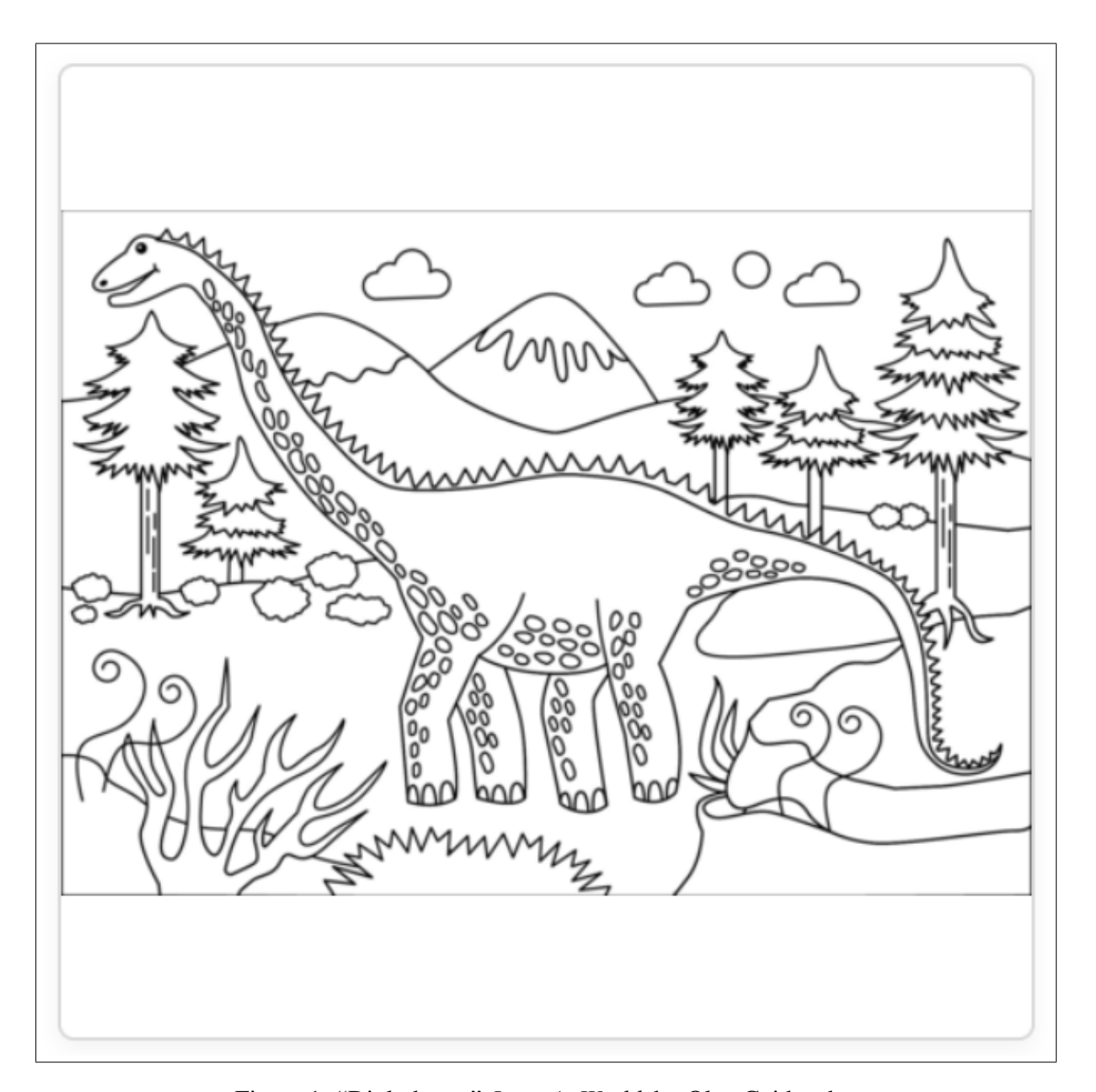
Figure 1: "Diplodocus," Jurassic World, by Olga Gaidoush

Permission: Free for personal, educational, editorial or noncommercial use. This work is licensed under a Creative Commons Attribution–Noncommercial 4.0 License. Attribution is required in case of distribution.