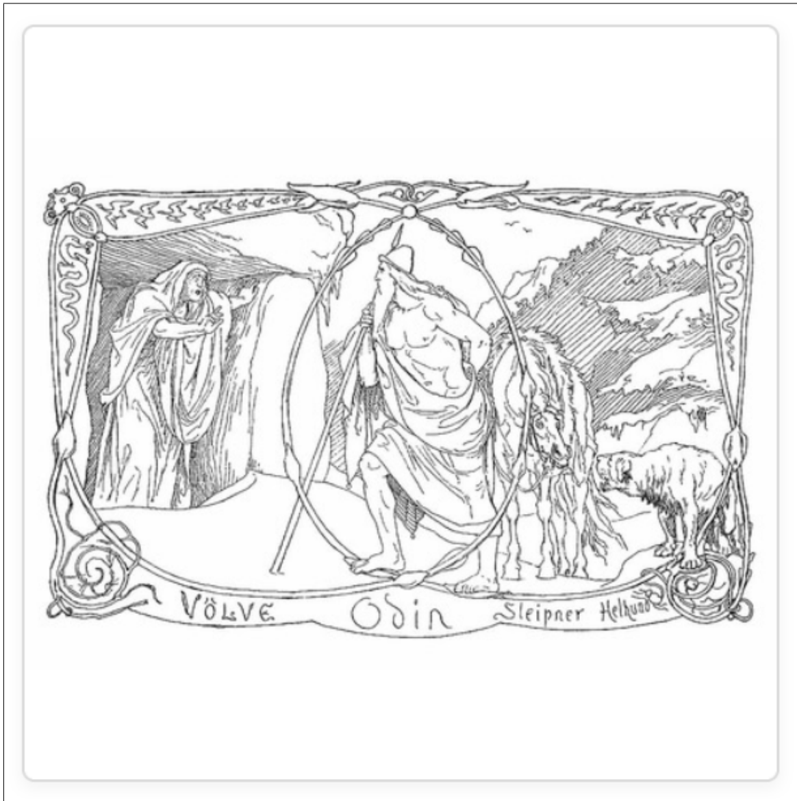
Figure 1: Völve, Odin, Sleipner and Helhund , original image credit: Gjellerup's Edda Illustrations by Lorenz Frølich

Permission: Free for personal, educational, editorial or commercial use. This work is in the Public domain. Attribution is not required but welcomed.