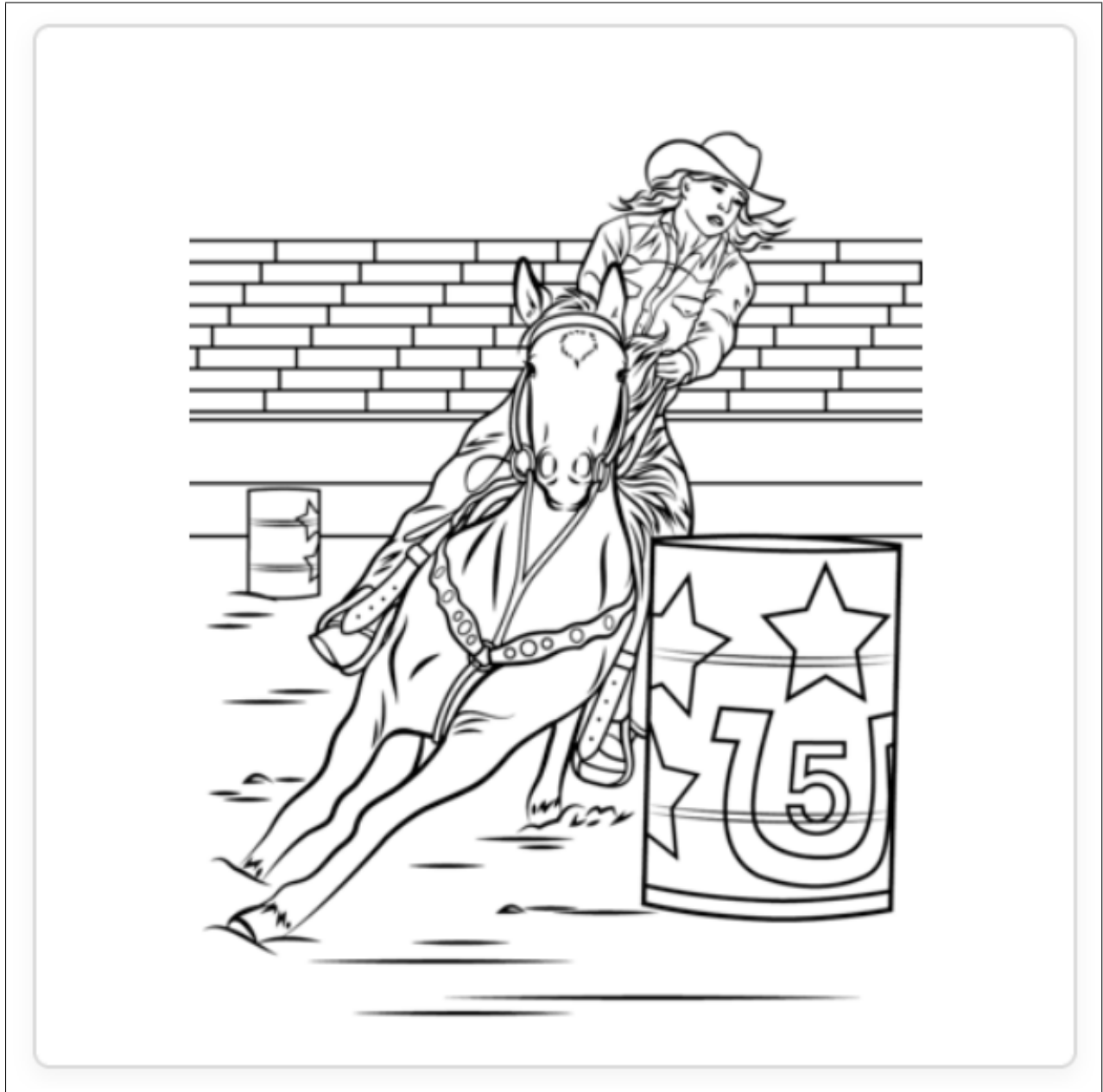
Figure 1: Horse Barrel Racing , by Artsashina

Permission: Free for personal, educational, editorial or commercial use. This work is licensed under a Creative Commons Attribution-Share Alike 4.0 License. Attribution is required in case of distribution.