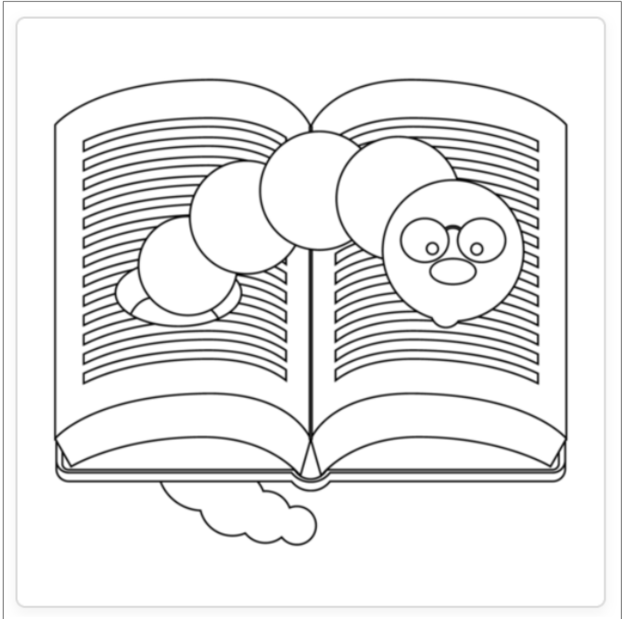
Figure 1: "Book Worm," Simple Objects II , by SuperColoring

Permission: Free for personal, educational, editorial or noncommercial use. This work is licensed under a Creative Commons Attribution-Noncommercial 4.0 License. Attribution is required in case of distribution.