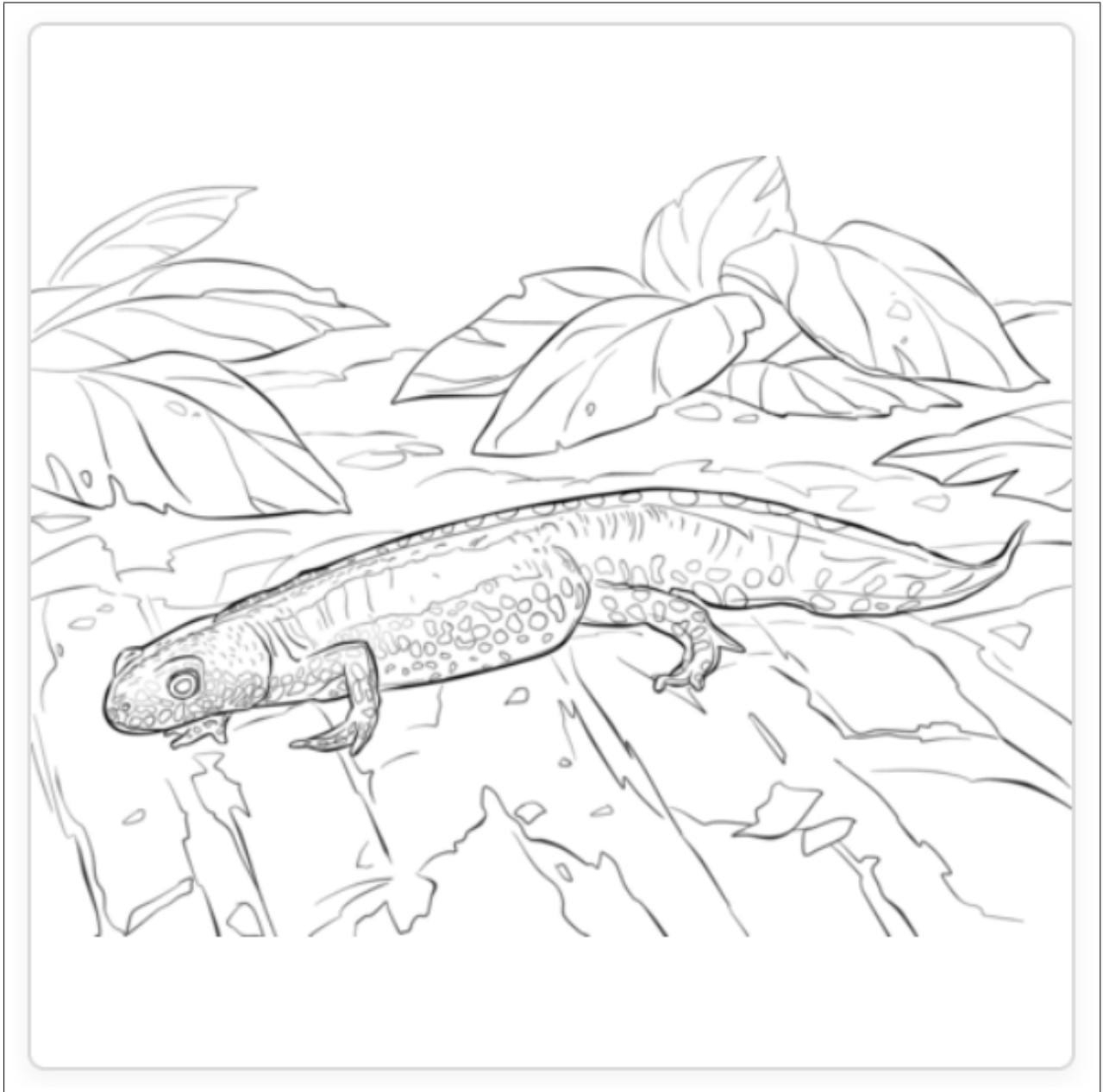
Figure 2: Alpine Newt , by Yulia Znayduk

Permission: Free for personal, educational, editorial or commercial use. This work is licensed under a Creative Commons Attribution-Share Alike 4.0 License. Attribution is required in case of distribution.