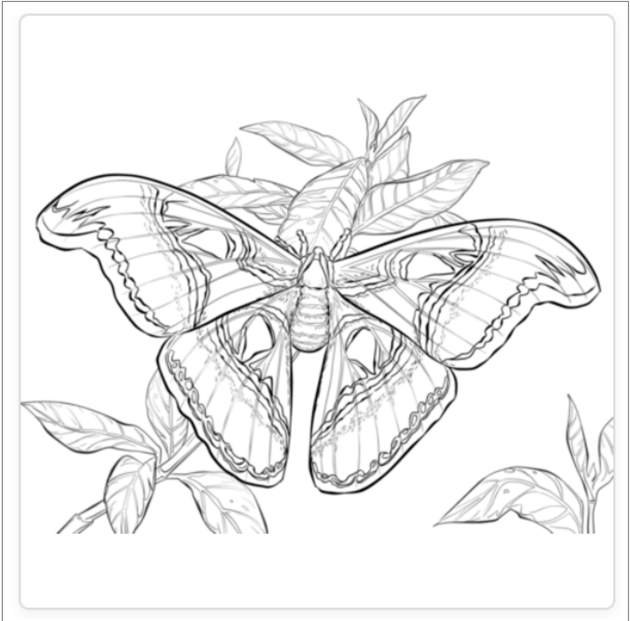
Figure 1: Realistic Atlas Moth , by SuperColoring

Permission: Free for personal, educational, editorial or commercial use. This work is licensed under a Creative Commons Attribution-Share Alike 4.0 License. Attribution is required in case of distribution.