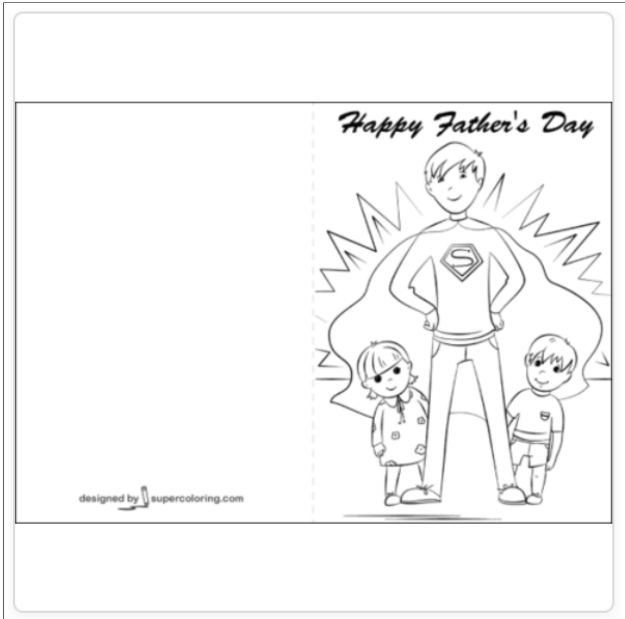
Figure 1: Happy Father's Day Card , by Lena London

Permission: Free for personal, educational, editorial or commercial use. This work is licensed under a Creative Commons Attribution-Share Alike 4.0 License. Attribution is required in case of distribution.