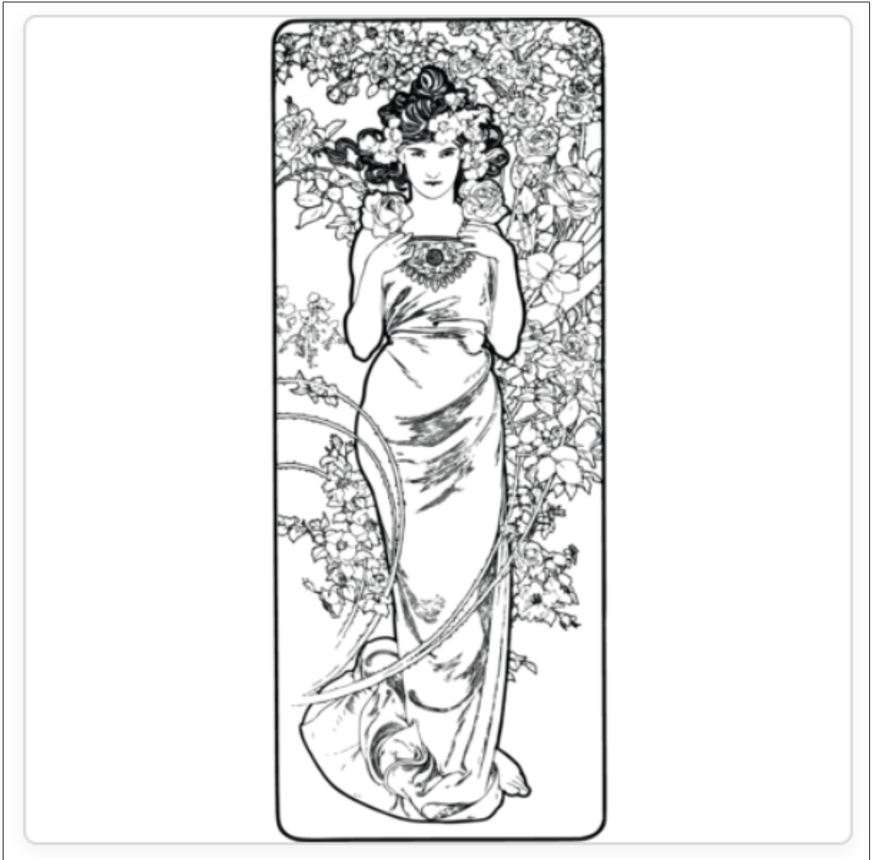
Figure 2: The Flowers: Rose by Alphonse Mucha, by Nata Silina

Permission: Free for personal, educational, editorial or commercial use. This work is in the Public domain. Attribution is not required but welcomed.