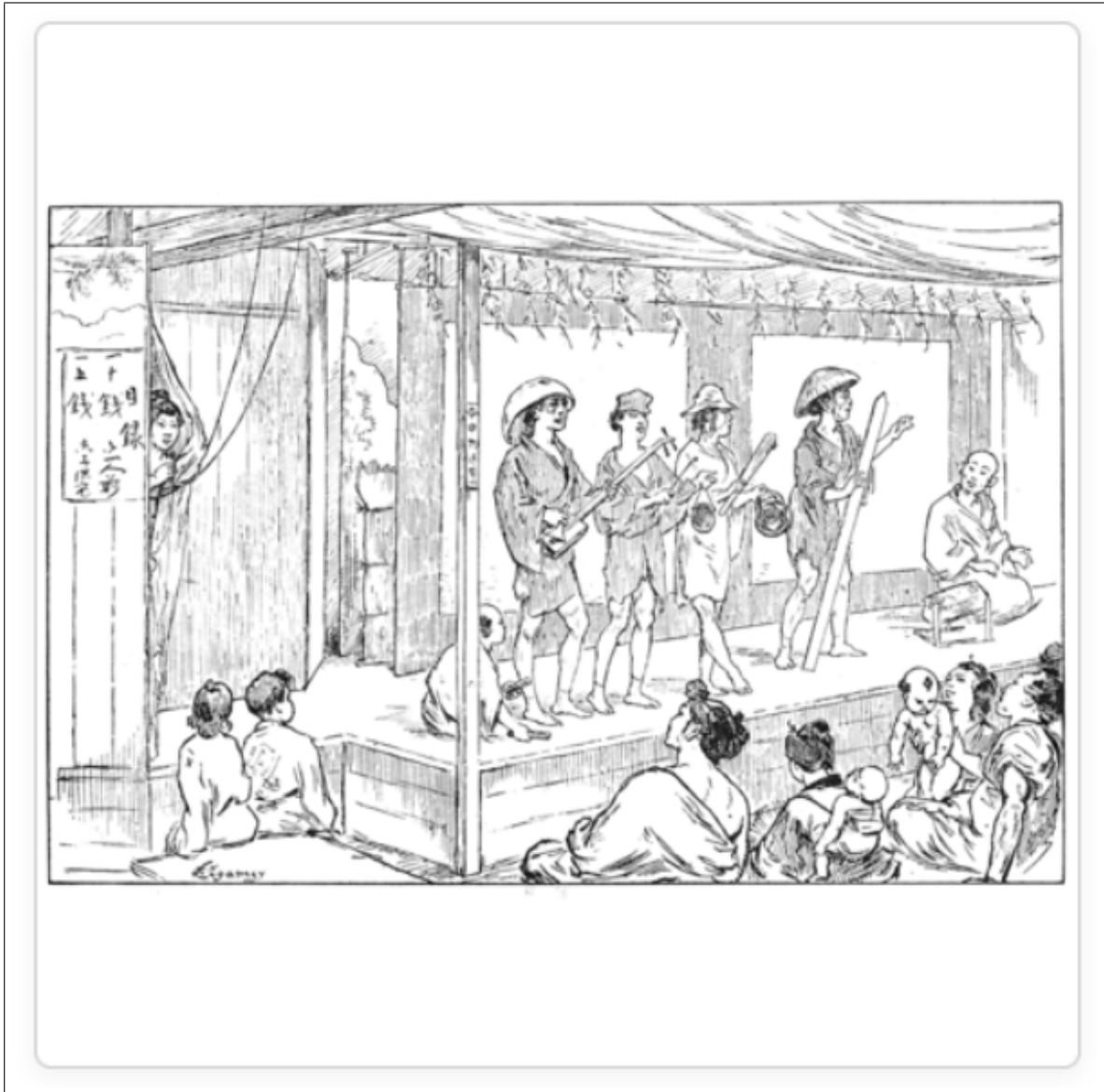
Figure 2: original image credit: Illustrations by Félix Régamey for Promenades Japonaise—Tokio–Nikko

Permission: Free for personal, educational, editorial or commercial use. This work is in the Public domain. Attribution is not required but welcomed.