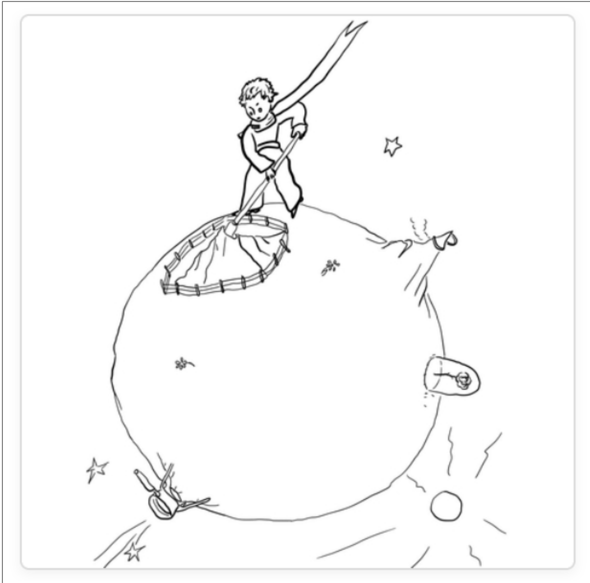
Figure 1: Little Prince Cleaning Volcanoes , by Nata Silina, original image credit: The Little Prince Illustrations by Antoine de Saint-Exupéry

Permission: Free for personal, educational, editorial or commercial use. This work is licensed under a Creative Commons Attribution-Share Alike 4.0 License. Attribution is required in case of distribution.