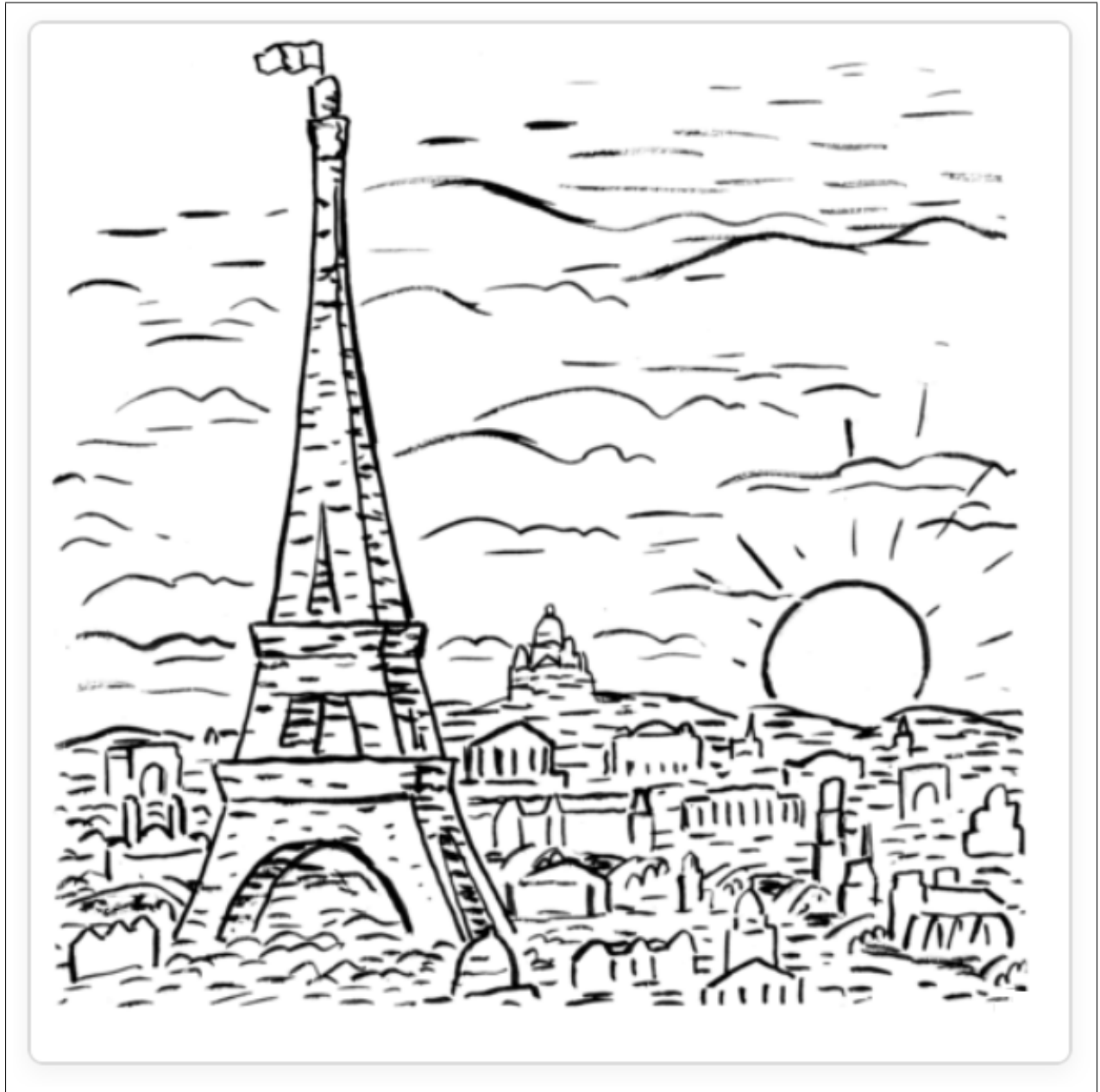
Figure 2: View of Paris with the Eiffel Tower , original image credit: Drawings by Leo Gestel

Permission: Free for personal, educational, editorial or commercial use. This work is in the Public domain. Attribution is not required but welcomed.