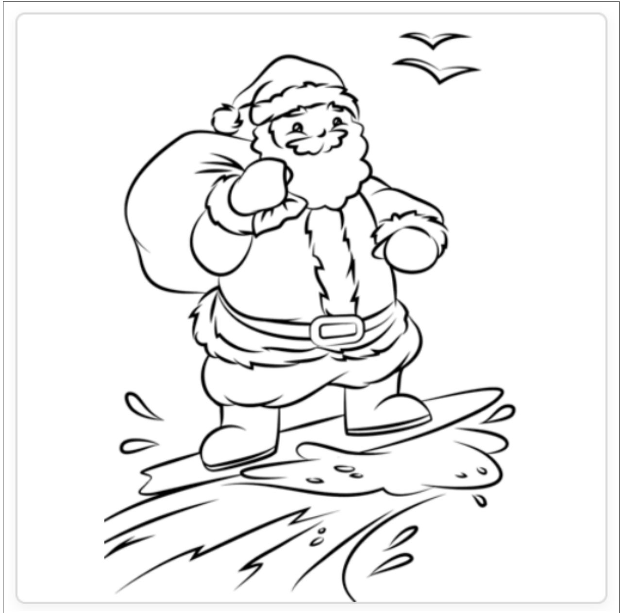
Figure 1: Santa Surfing , by Artsashina

Permission: Free for personal, educational, editorial or commercial use. This work is licensed under a Creative Commons Attribution-Share Alike 4.0 License. Attribution is required in case of distribution.