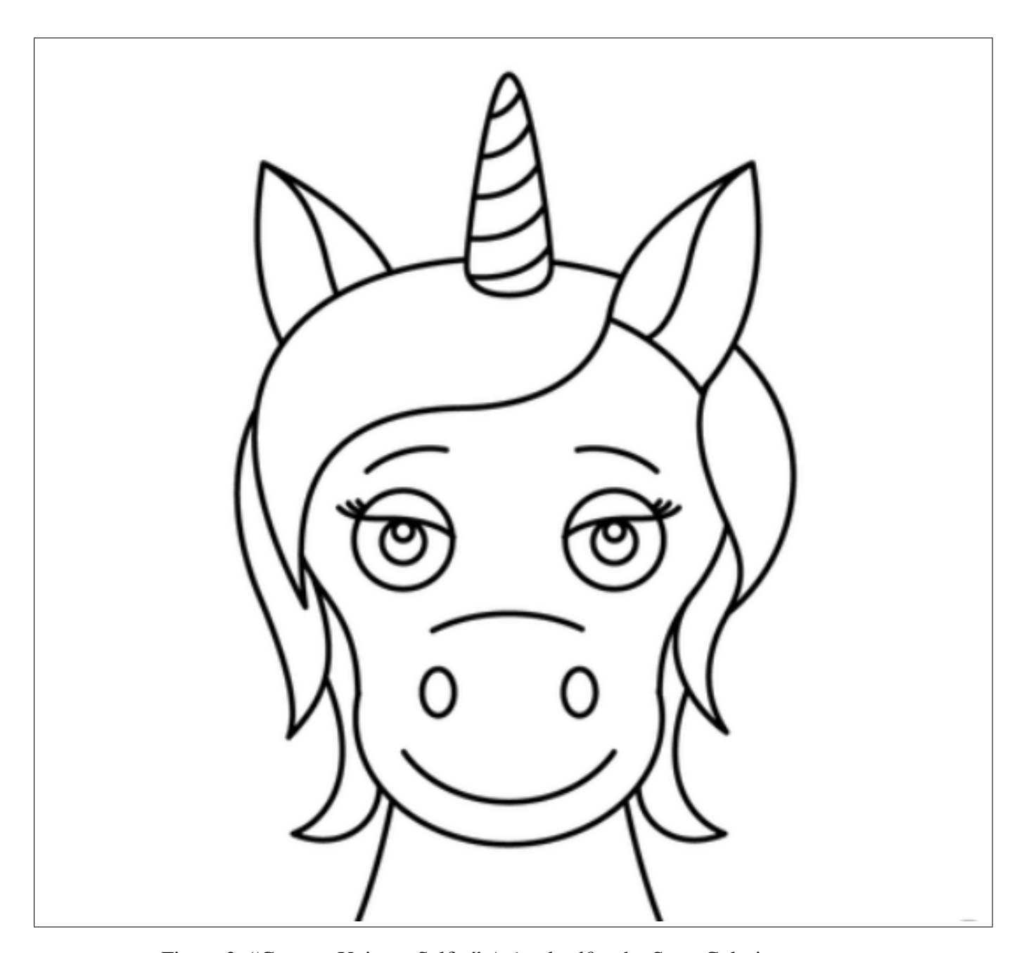
Figure 2: "Cartoon Unicorn Selfie," Animal selfies, by SuperColoring

Permission: Free for personal, educational, editorial or noncommercial use. This work is licensed under a Creative Commons Attribution–Noncommercial 4.0 License. Attribution is required in case of distribution.