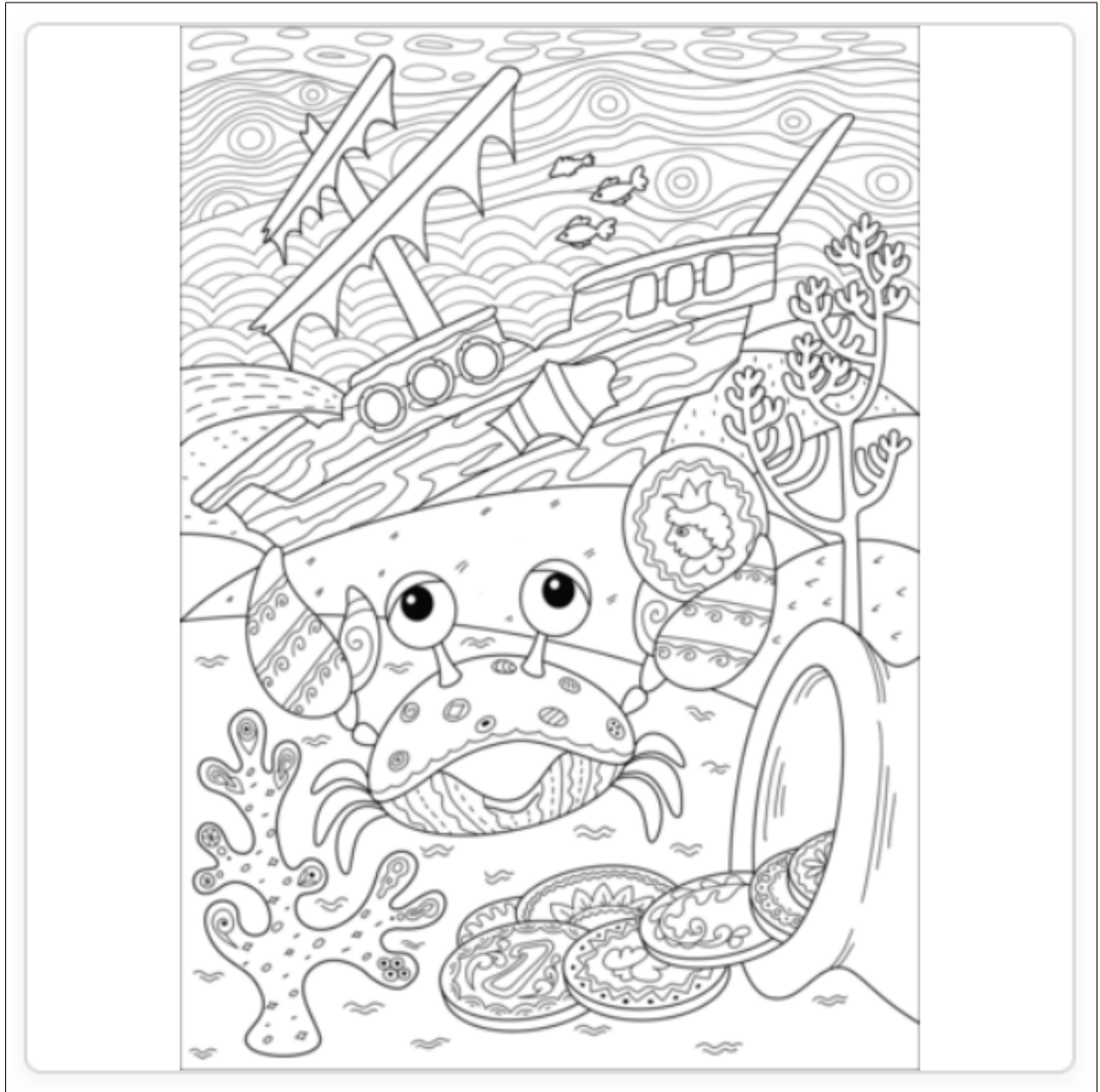
Figure 2: Crab Found Treasure near Sunken Ship , by Sayapin Alexandr

Permission: Free for personal, educational, editorial or noncommercial use. This work is licensed under a Creative Commons Attribution-Noncommercial 4.0 License. Attribution is required in case of distribution.