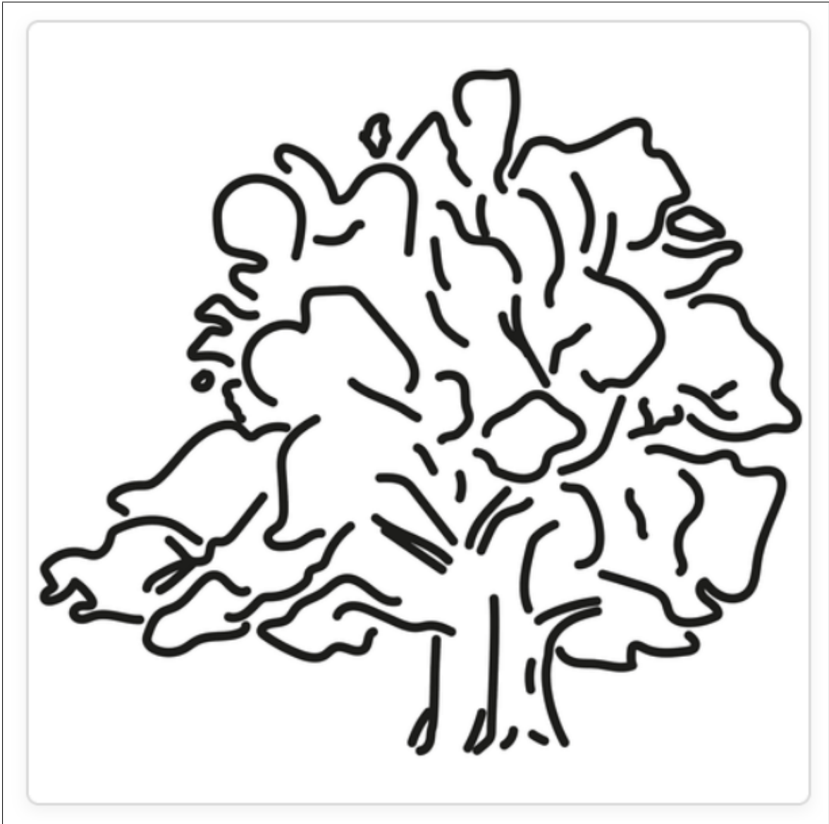
Figure 1: Estonia: Tamme-Lauri's Oak , original image credit: Wikipedia 15 marks designed by Toomasb

Permission: Free for personal, educational, editorial or commercial use. This work is in the Public domain. Attribution is not required but welcomed.