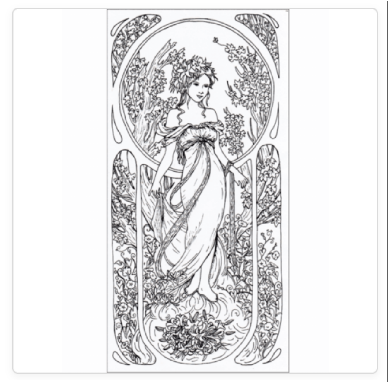
Figure 1: Tribute to Alfons Mucha , original image credit: Lineart by EpsilonEridani

Permission: Free for personal, educational, editorial or commercial use. This work is licensed under a Creative Commons Attribution-Share Alike 4.0 License. Attribution is required in case of distribution.