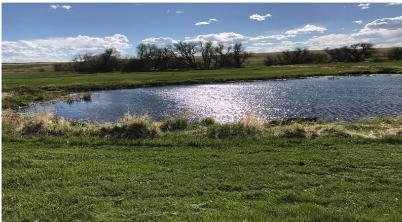
Cherry Valley Event Venue 8636 S. State Highway 83 Franktown, CO 80116 Douglas County