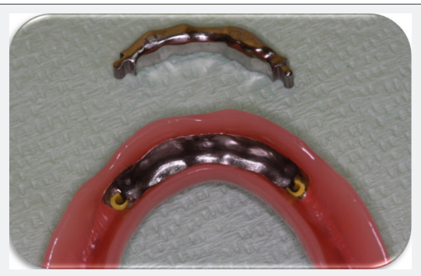
Figure 4: Bar-retained Overdenture Prosthesis.