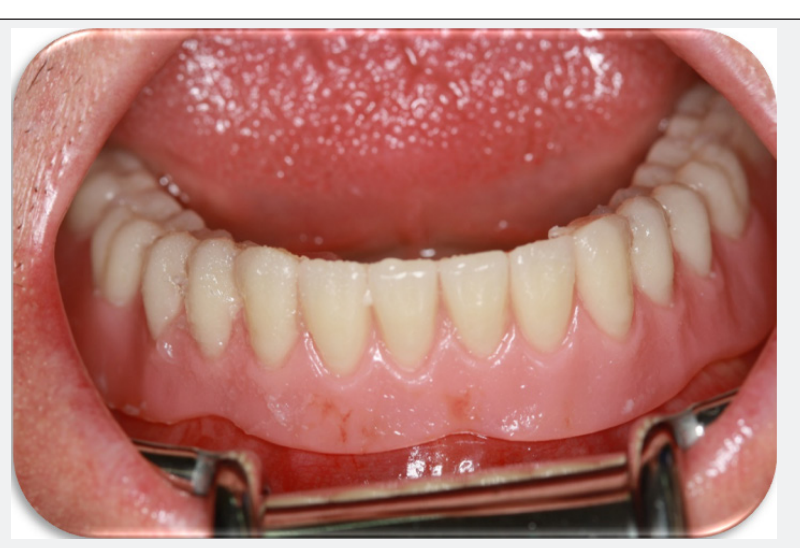
Figure 5: Overdenture Prosthesis intra-orally.