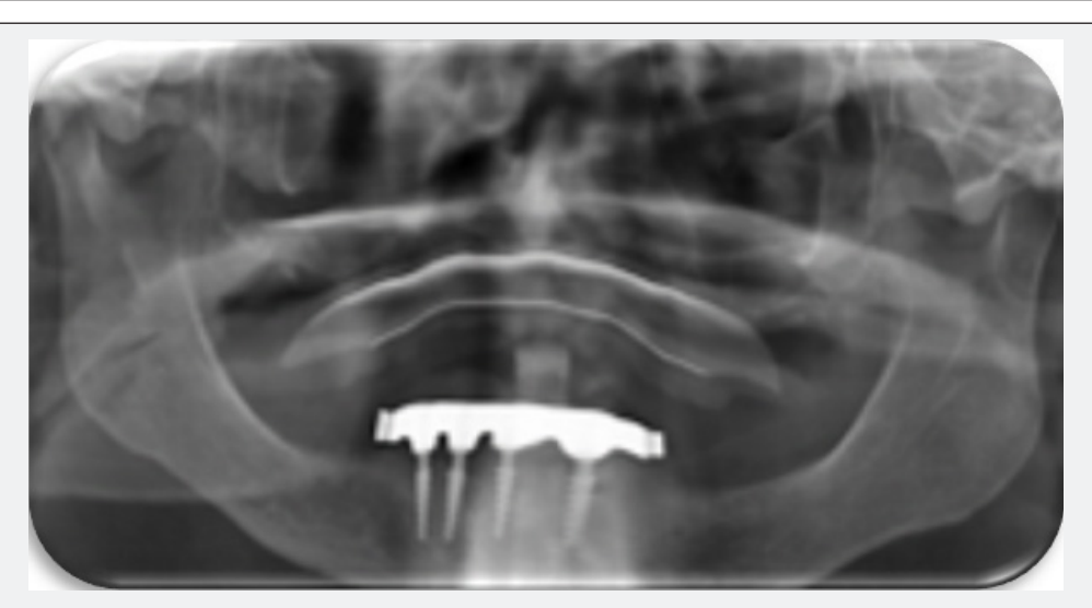
Figure 6: Post-operative panoramic radiograph.