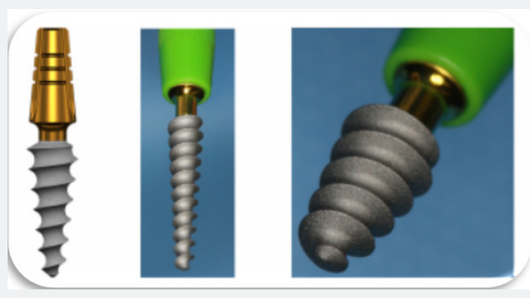
Figure 3: one-piece implant with a compression thread

one-piece implants of 3,5mm diameter and 14mm length were inserted flapless in positions 31, 32, 41 and 42 with a torque of 50N. One Piece implants (Figure 3) are machined in grade 23 titanium with a hydroxyapatite/beta tricalcium phosphate surface (HA/BTCP), the implant can be used to create single restorations in situations where high primary stability is achieved on placement.