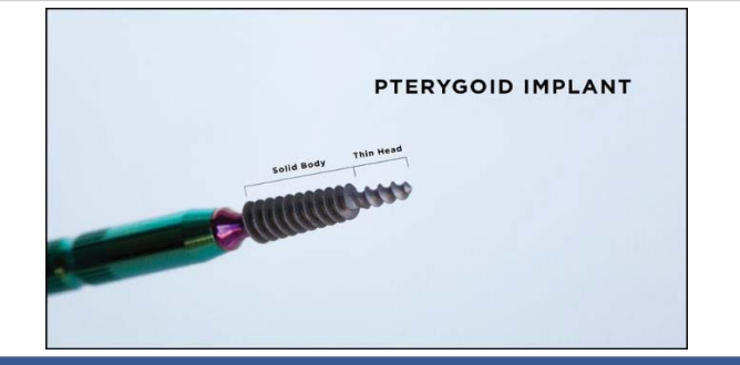
Figure 18: Pterygoid Implant.