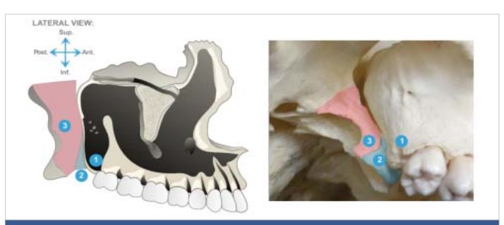
Figure 20: Anatomy of the pterygoid area is made of the assemblage of 3 bones: (1) Anterior – maxillary tuberosity; (2) The middle pyramidal process of the palatine bone articulated with the pterygoid notch; (3) Posterior: Pterygoid process of the sphenoid..