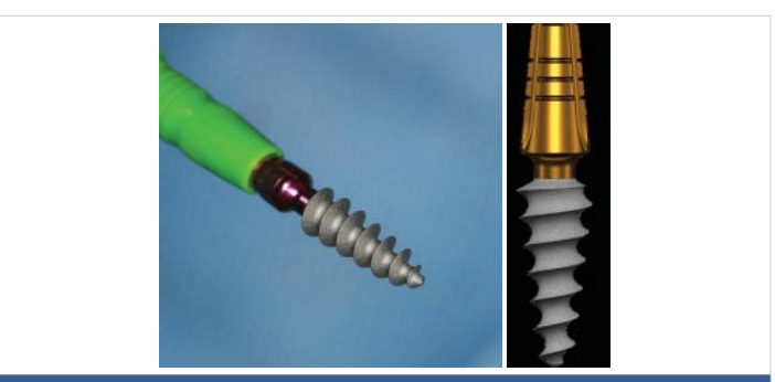
Figure 1: One-Piece implant with a compression thread.

The one-piece implant is a stand-alone implant that offers patient and surgeon a new treatment option without bone graft, less morbidity and reduces the treatment time.