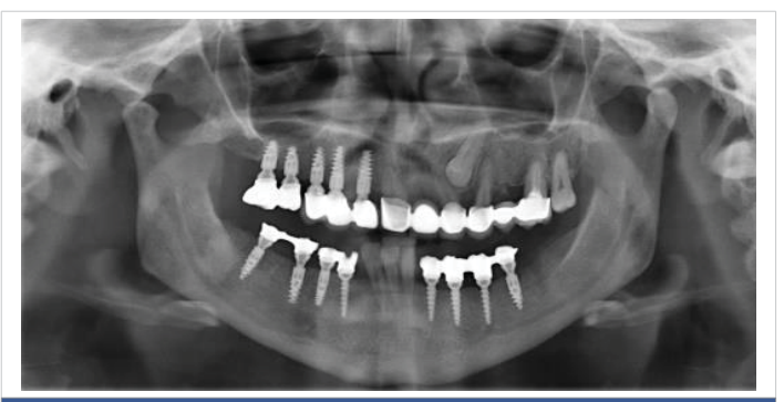
Figure 9: Panoramic radiograph of patient 2 at completion of treatment.

Patient 5: A 58 years old presented at the clinic with a reason to get fixed teeth to replace the edentulous space in the upper arch. A clinical examination showed edentulous upper right arch with resorbed ridge. Radiographic