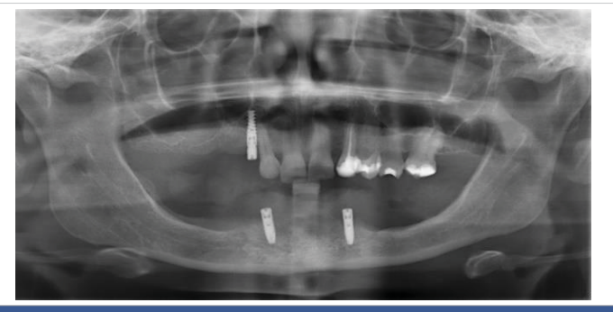
Figure 2: Shows the panoramic radiograph of the patient at presentation

Five days after the try-in an appointment for prosthesis delivery was given. In the maxilla, the bridge was screwed (Figure 4). The patient was reviewed after 2 weeks. Thereafter,