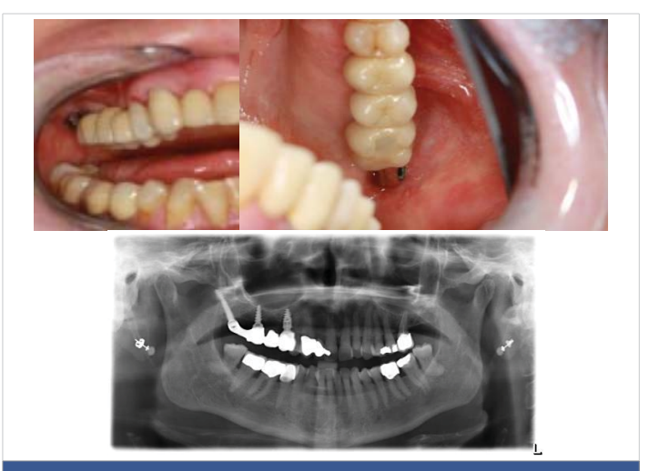
Figure 17: Panoramic radiograph and clinical photograph of the patient at the completion of treatment.

Pterygoid Implant ranges from 16 to 26 mm, they have a pointed, self-tapping apex to ensure a strong anchorage when inserted [4] [12]. The implant neck has a wide thread profile which provides compression in the region of the tuberosity, where the bone is often of low density.