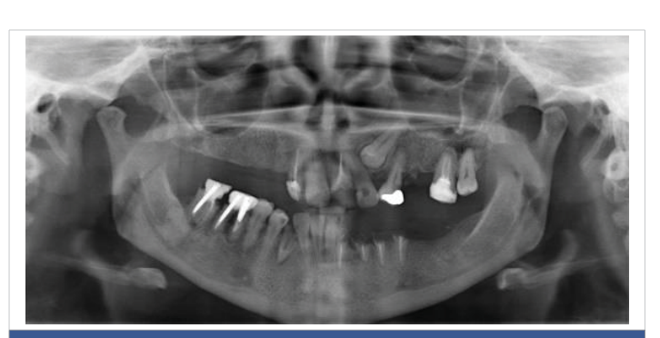
Figure 8: Panoramic radiograph of patient 3 at presentation showing edentulous upper arch with resorbed alveolus and remaining lower teeth.