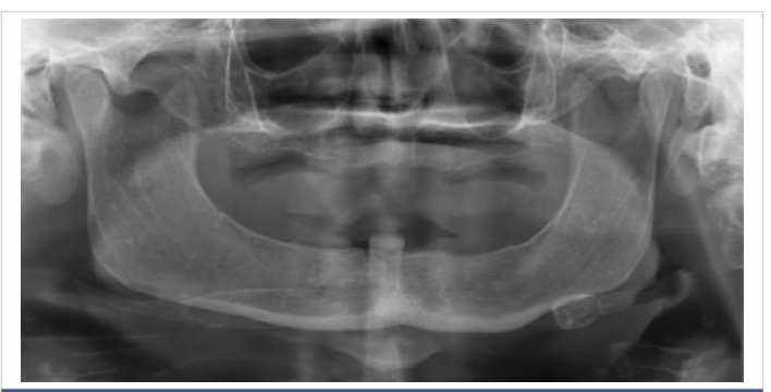
Figure 10: Panoramic radiograph of patient at presentation showing edentulous upper arch with resorbed alveolus and remaining lower teeth.