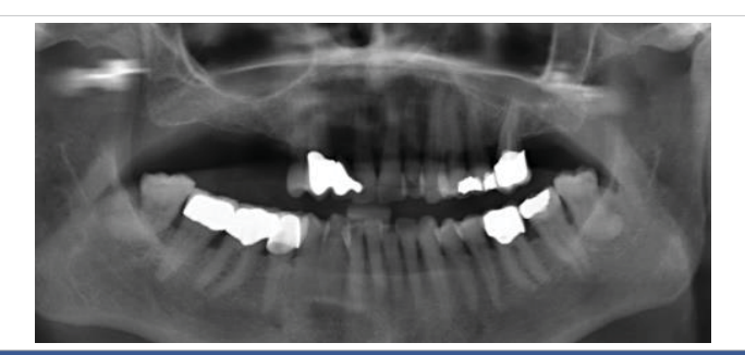
Figure 14: Panoramic radiograph of the patient at presentation showing edentulous upper arch with resorbed alveolus and remaining lower teeth.

The presented case reports describe how the pterygoid and one-piece implants were used for the functional restoration of an edentulous patient with atrophied jaw who does not want