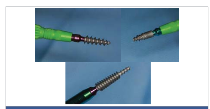
Figure 15: 3 types of implants, One piece, two-piece implant and a pterygoid implant (ROOTT-implants,TRATE AG).