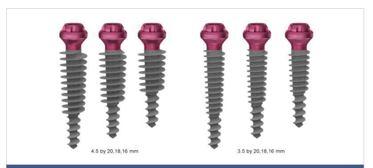
Figure 19: The 4.5- and 3.5-mm diameter pterygoid implants from TRATE

The tuberosity of the maxilla has been showed to compose of a low density bone type III or type IV figure 21.