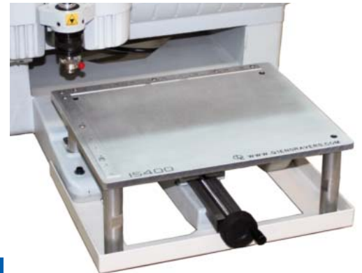
IS400: Vise does fit under table Trophy Master: Does not fit under on table

NIS-1401-188 Table Scale Set (.188" thk) for OEM T-Slot Table .....$135.00