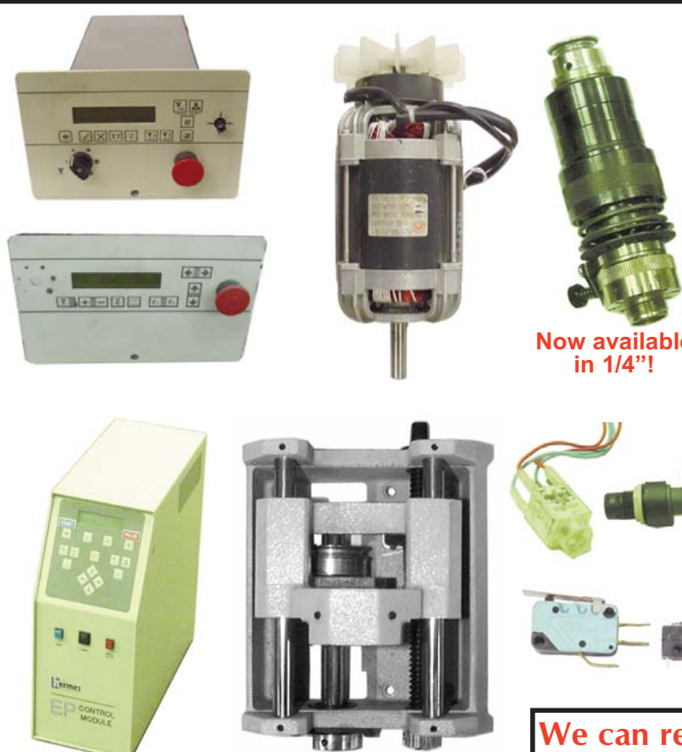
Now available in 1/4"!