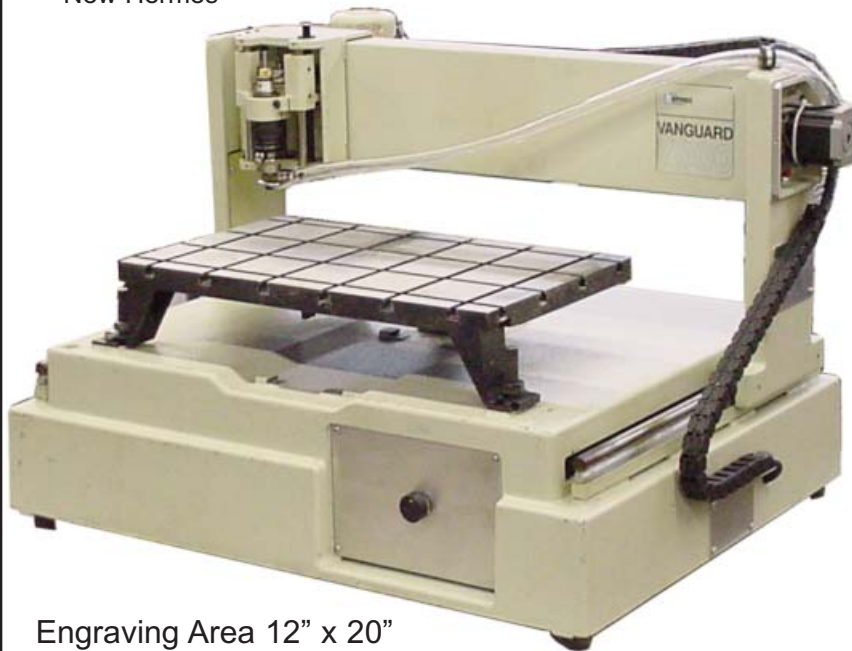
Engraving Area 12" x 20"