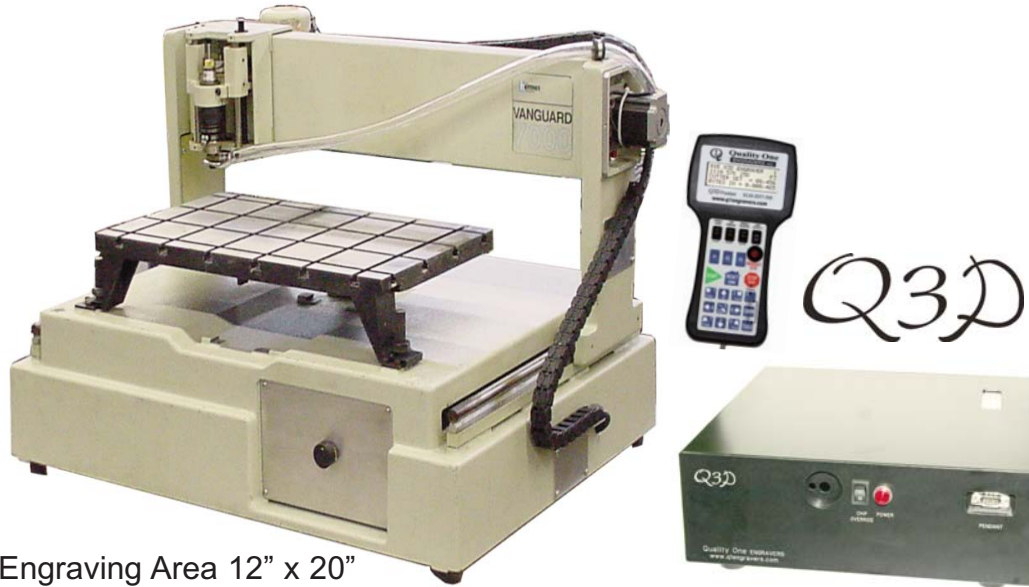
Engraving Area 12" x 20"

Want your V7000 to run from Latest Softwares? Want Logo capability? No Problem... Get a PC Retrofit for your V7000!