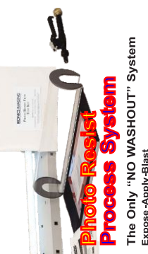
Photo-Resist Process System