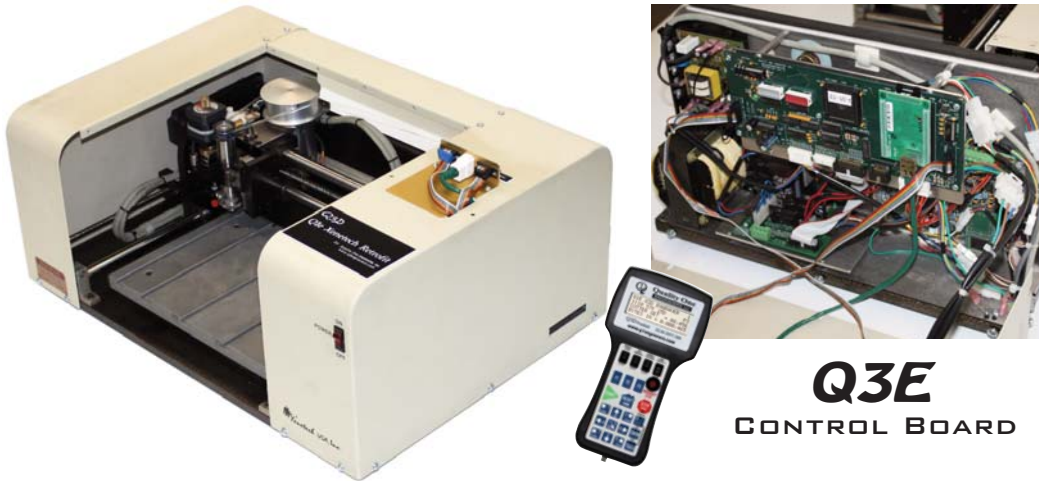
Q3E CONTROL BOARD

Engraving Area, Table Features, Touch Sensor, Spindle Speed and Chip Control all remain intact. Get rid of quarks, glitches & computer lockups.