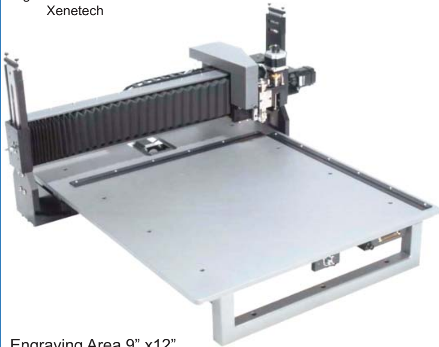
Engraving Area 9" x12"