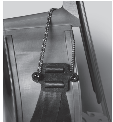
STEP 4 Once it's all securely attached, it's ready to roll!