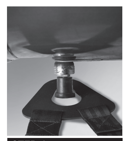
STEP 1 Place the cello on its side and place the plastic loop over the endpin.