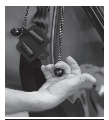
STEP 3 Bring bungee cord around neck. Secure ball end to bungee buckle hook.