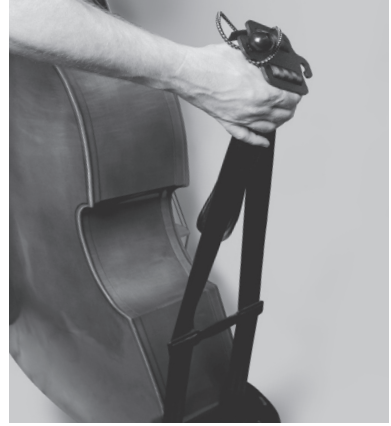
STEP 2 With cello on its side, place chassis along top side of instrument pulling it taut.