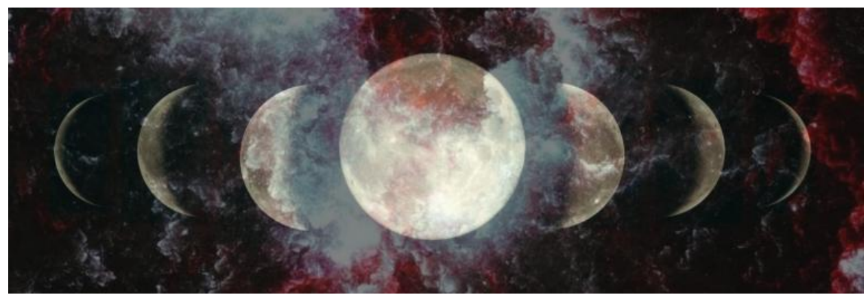
Collage of canstock photos

Ensure that the space you'll do the working in is safe and without toxicity.