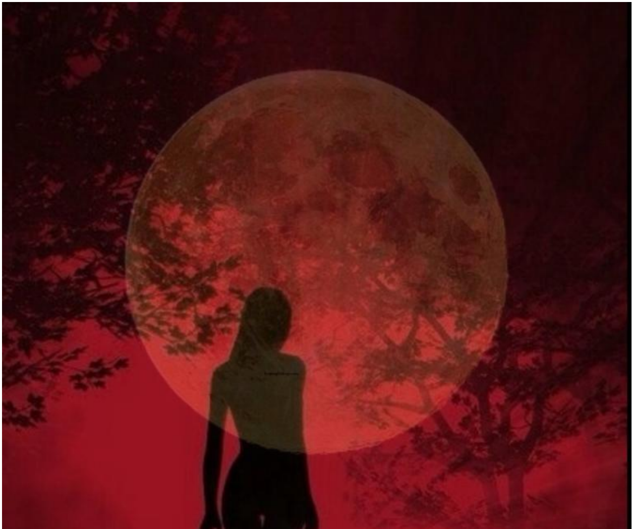
Collage of canstock images.

It is natural for the witch to summon the moon's energy. We draw her down, reside in her shadows, ride her winds and rise from her waves. This is the remembering of what we have always known. The moon is our divine mediator: the merging of the stars, darkness, and earth. Our ally in working with the forces and spirits. Practicing lunar magick involves drawing the moon into our rituals and spells, merging with our focus and then releasing it, including The Sacred Seven Moon Summoning technique.