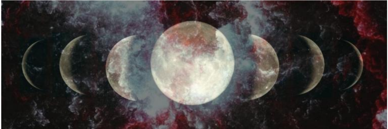
Collage of canstock photos

Ensure that the space you'll do the working in is safe and without toxicity.