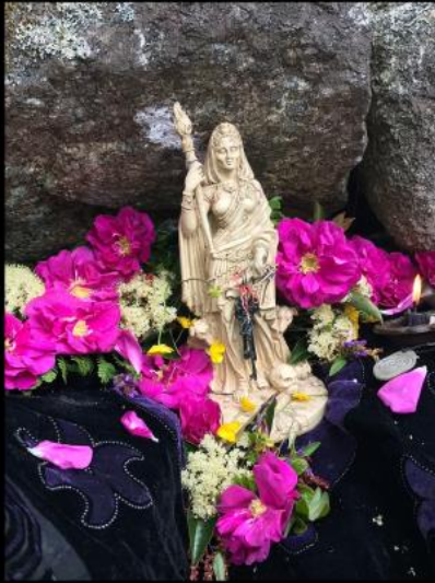
Keeping Her Keys

Connected since ancient times with blood, death and passion, wild roses and their fruit can be used to summon these energies and the divine feminine.