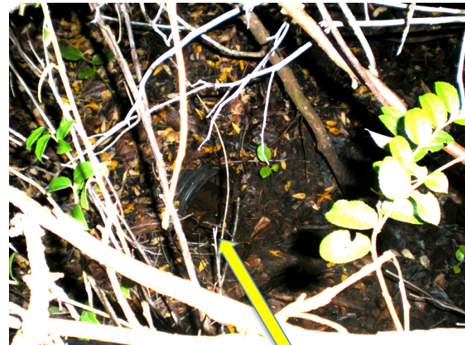
Pipe opening 15 feet north of transformer and 10 to 15 feet from road edge.