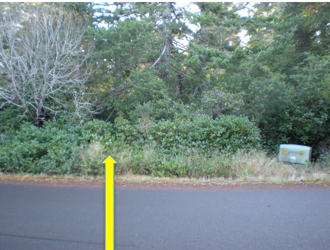
Discharge into lake approx 15 feet north of transformer.