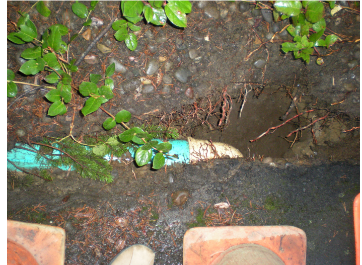
Pipe from under road at lot 15