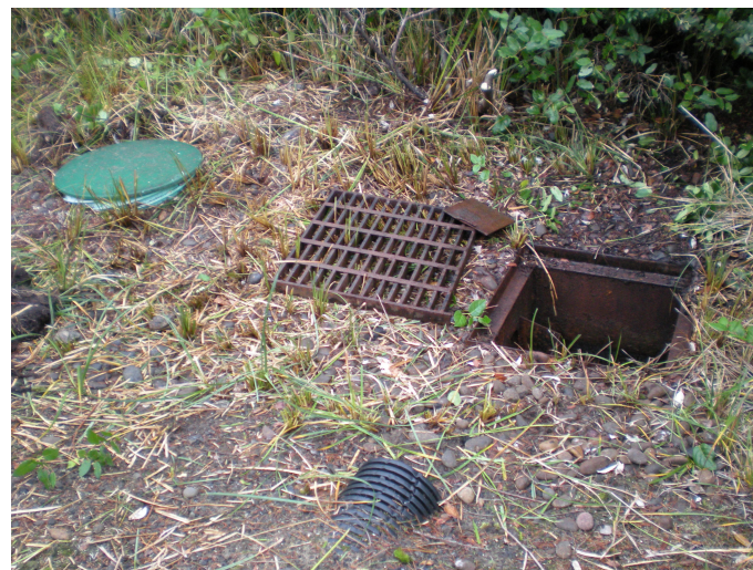
Lot 14 Catch basin, tank and pipe from lot 24