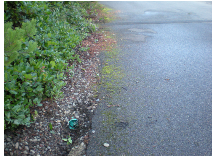
Lot 15 end of pipe from Lot 22 Catch Basin