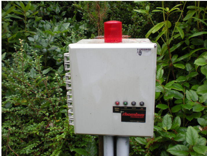
Pump control box with alarm light. Alarm lights up if top float goes on; indicating pump failed to lower water level.