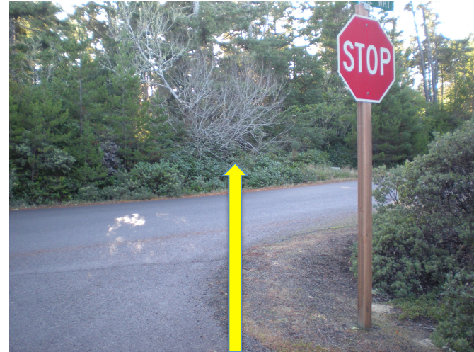
Tank discharge goes under Woodlake Way and slightly south toward lot 36 before transformer.