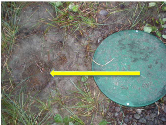
Check valve and left tank lid