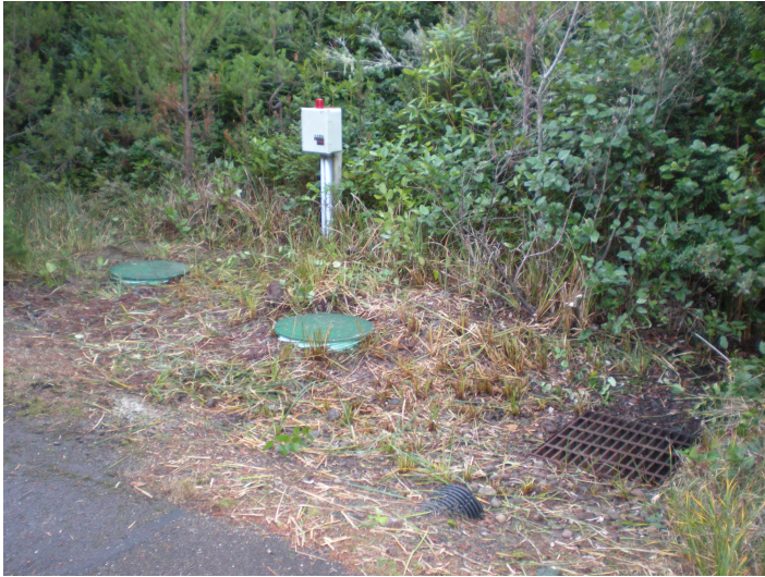
Catch Basin, Tank and Pump Control Box