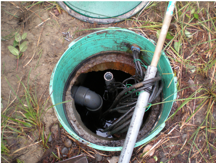
Left tank opening, floats, pump and discharge pipe to lake between lots 35 & 36