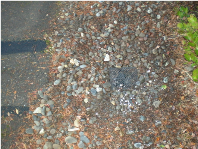
Small drain on lot 24. Has "T" from home on Lot 24. Goes to catch basin on lot 14.