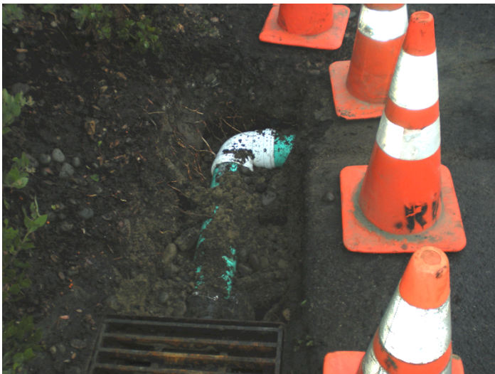
Lot 22 Catch basin pipe under road to lot 15