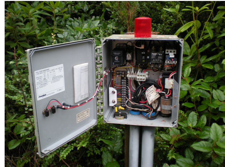
Pump control box with wiring diagram on inside of door. Audible alarm disconnected in the past.