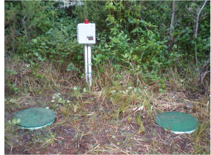
Lot 14 Tank and Pump Control Box