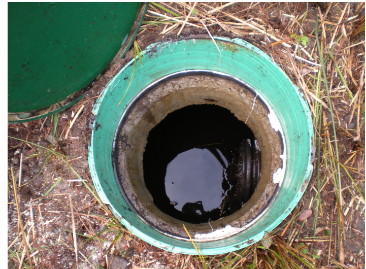
Right tank opening; separate compartment for large solids