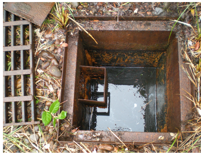
Lot 14 Catch basin and discharge to tank