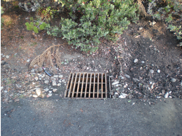
Lot 22 Catch Basin