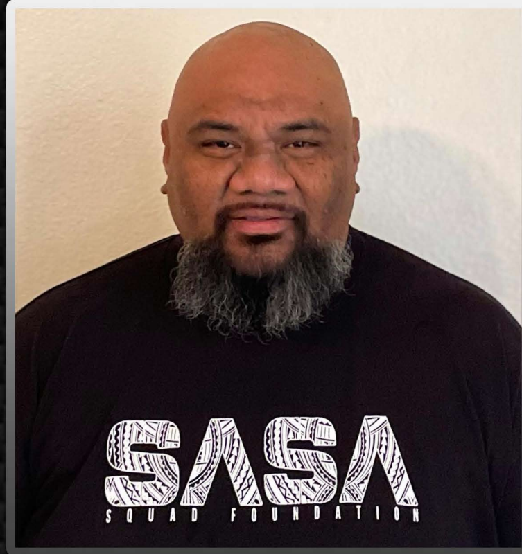
VICE PRESIDENT HEAD OLINE COACH