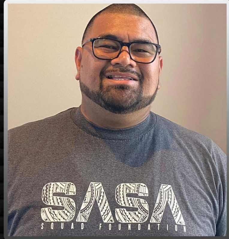
PRESIDENT OLINE COACH