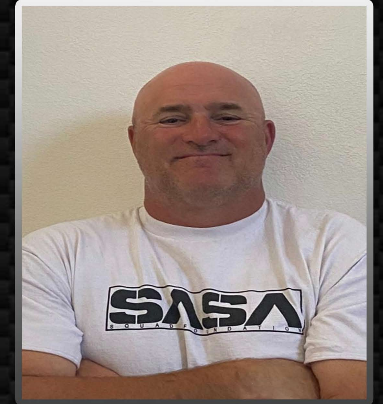
HEAD DL COACH

THE SASA SQUAD FOUNDATION TEAM WAS CURATED THROUGH THE RIGHT MIX OF CHARACTER AND CAPABILITIES. THROUGH THE COLLECTIVE BRILLIANCE OF THE TALENTS AND GIFTS OF EACH MEMBER, OUR ORGANIZATION NOT ONLY EXUDES THE SASA MISSION, BUT OPERATES AS AN ORGANIZATION AS SUCH—A UNIQUE EXPERIENCE FOR KIDS IN THESE TIMES.