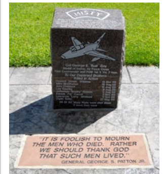
The Misty Memorial, Colorado Springs, CO

While The Misty Experiment: The Secret Battle for the Ho Chi Minh Trail may be a mere paragraph when compared to the countless pages of human stories of the Vietnam War, its producers believe this commemorative national television documentary, with your support, can help heal deep divisions that have endured since that conflict’s end.