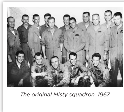
The original Misty squadron. 1967

A half-century after the end of the Vietnam War, there is still very little public consensus about what happened there, or why. With the impetus of a nationwide 50th Anniversary Commemoration, American radio and television broadcasters now plan to honor the service and sacrifice of the millions of men and women engaged in that conflict by offering diverse media programs to provide contemporary audiences with renewed clarity to the issues and meaning of that distant yet painful conflict in Southeast Asia.