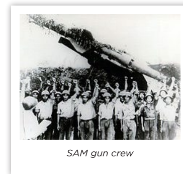
SAM gun crew

As North Vietnamese air defenses strengthened, casualties to U.S. FAC patrols increased and, as a result, the southbound movements of enemy supply trucks and troops became less observed and constrained. It became imperative for American military strategists to implement a new method of air-reconnaissance over Vietnam’s artillery-infested landscape.