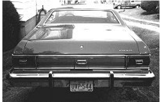
The bumper protection package also included the rear bumper vertical bars.