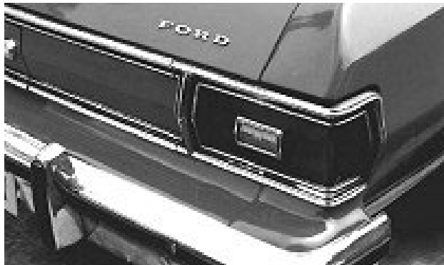
The taillights were very attractive and wrapped around the fender for side viewing.