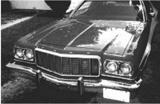
A mandatory option on the "Starsky & Hutch" cars was the bumper protection group. (vertical bars on the bumper).