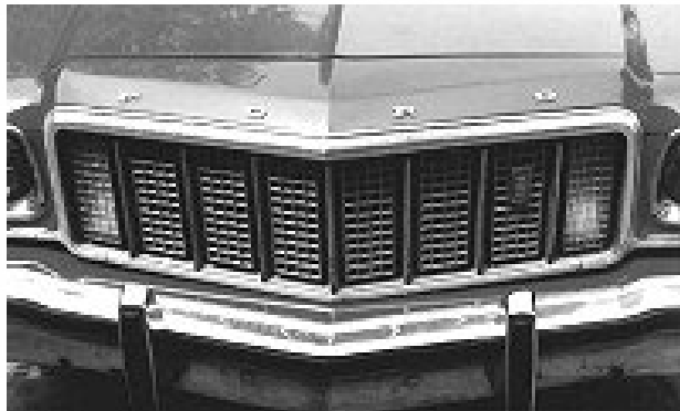
The open grille style was a continuation of the theme begun with the 1973 Torino, but looked much like the 1975 design.