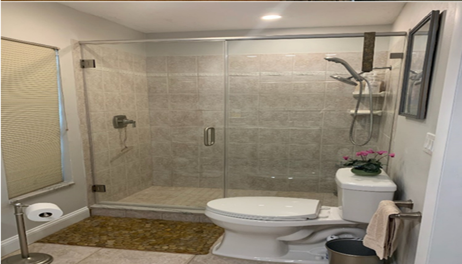
Master Bath Walk in shower