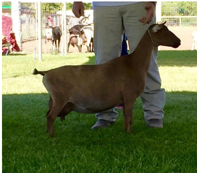
Amethyst's dam (Bramblestone Ruby's)

Her dam, Ruby, earned her 1st Championship leg, her milking stars , and scored an 87 in linear appraisal as a third freshener.