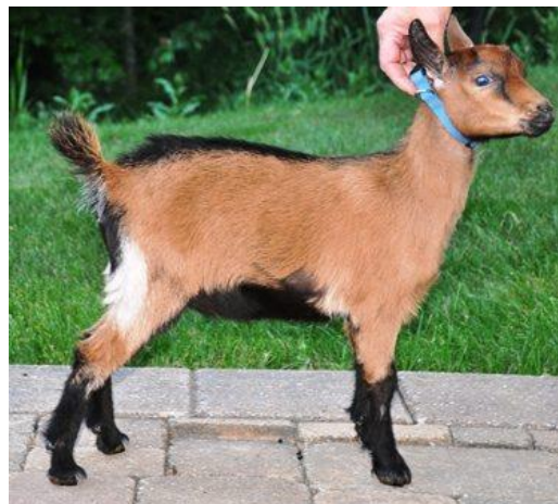
Young 3*M Bramblestone Amethyst

The photo below is of Amethyst at about three months.